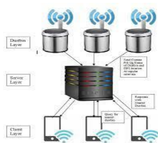
Fig.1.1 Different Layer

This system has been divided into three layers: