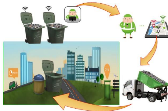
Fig.1.3 Collection Process of garbage